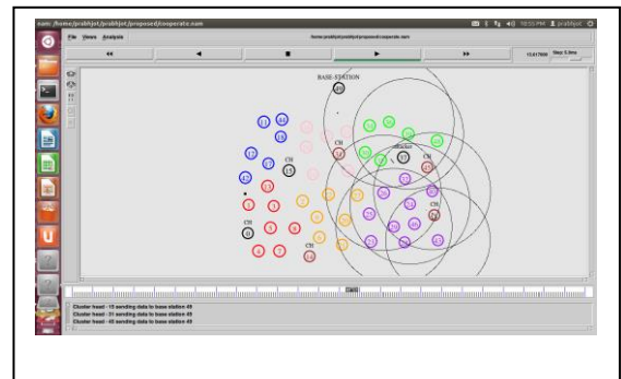
Fig.5- Again cluster head send control packet to base station