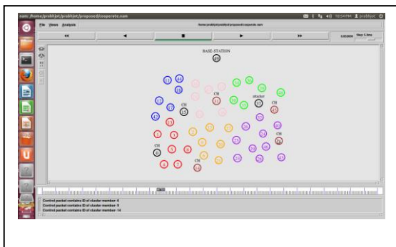
Fig.4- Again selection of cluster head