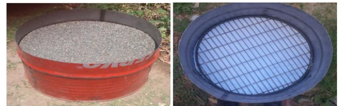
Figure 3: Conventional filter (left) and Geotextile based filter (right)