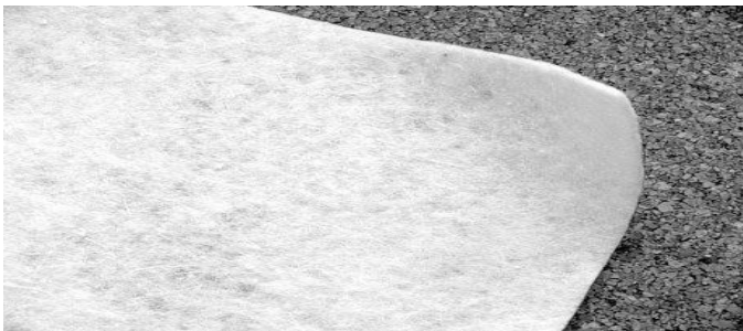
Figure 1: Non woven geotextile