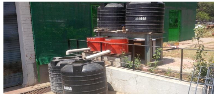
Figure 2: Model consisting of both filters

The purpose of this construction was to collect samples before and after passing from both the filters and to calculate discharge rate from both filters. The samples collected were then tested in the laboratory for the parameters stated. A model was created in which both the filters were placed. It consisted of four water tanks with the capacity of 500 liters and a cylindrical drum which was cut in two equal parts and the bottom of these drums were closed and made water tight. These drums were properly cleaned and steel frames in the form of a mesh were made according to the size of the drum. These frames were placed inside the drum at the level of 130 mm above the bottom of the drum to support both the filter media to be placed inside them. These frames were provided with the rectangular openings to allow free flow of water. In these drums, both the filters were placed. Two of the cylindrical tanks and both drums were provided with the outlet for the flow of water. Water tanks were also provided with the stop valve for controlling the flow of water.