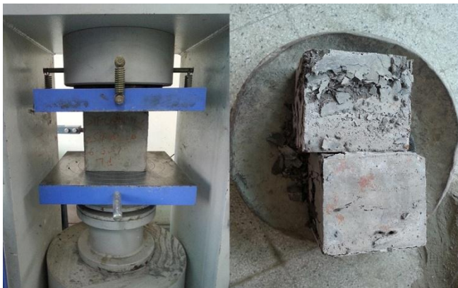
Figure 2 - Loading and Cracking of Cubes