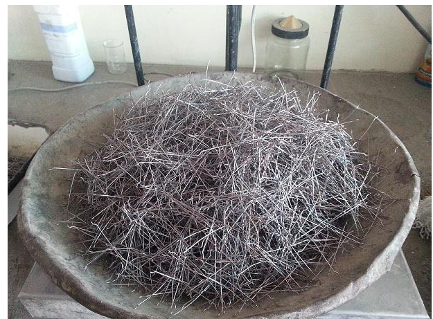
Figure 1 - Separated Fibers

From the investigation on slurry strength it has been found the optimum replacement of cement by Alccofine is 8 percent. And with the workability perspective 7 percent fibers by volume of mould has been used for SIFCON specimen.