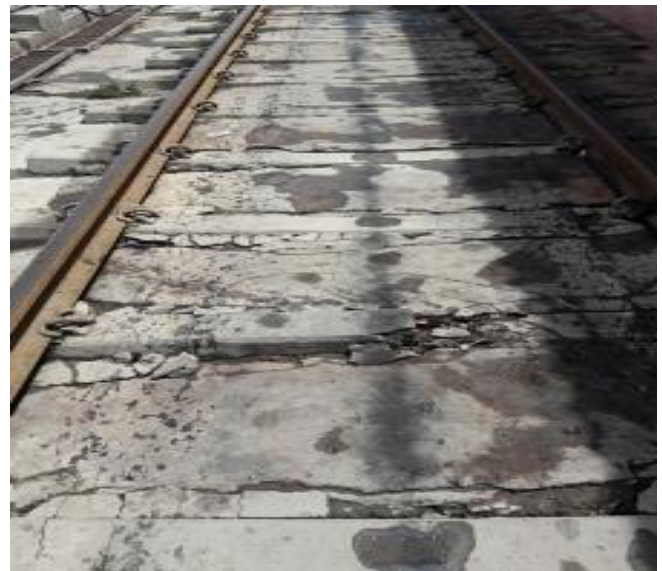
Fig.4 Deterioration of Cast-in-situ BLT

Longitudinal crack which is induced by the non homogeneous stress easily appear in the range of fastener. There are many cracks in the inner side of frame track slab, and some cracks run through the total depth of track slab. Some cracks were developed due to Non-linear and irreversible behavior of concrete material. Sometimes cracks are also caused by freezing and thawing of saturated concrete, or corrosion of reinforcing steel. However cracks from these sources may not appear for years.