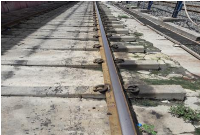
Fig.2 Cast-in-situ Ballastless track

Rail traffic is reaching out towards new horizon on ballastless track systems. The arguments are indeed convincing: long life cycles, top speed, ride comfort, and great load-carrying capability. Modification of this technology ensures safety and stability at speeds as high as 300 kmph. Practically ballastless track systems ensure its serviceability at a very low maintenance costs over many years.