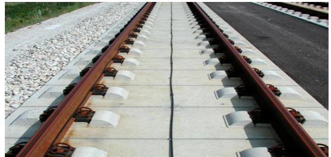
Fig. 9 Pre-stressed concrete Bi-block sleeper ballastless track system

Now a day's High speed railway is the future of whole railway system. There are best alternatives of Cast-in-situ ballastless track are Pre-stressed concrete bi-block sleeper ballastless track system. The basic system structure, however, always consists of modified bi-block sleepers which are securely and reliably embedded in a monolithic concrete slab. Highly elastic rail fastenings are essential to achieve the vertical rail deflection required for load distribution and for smooth train travel. The concrete track-supporting layer is the major load-distributing element of the system. Since it is cast-in-place, it can be individually adapted to any substructure type and condition. For embankments, it is designed as a continuous slab with free crack formation.