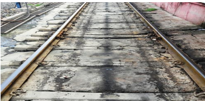
Fig.3 Deterioration of Cast-in-situ BLT

Main defect which have been observed in cast-in-situ ballastless track is deterioration of concrete of track slab. The service life of concrete structures is reduced drastically because of the deterioration of concrete. Deterioration of concrete takes place due to many reasons such as poor quality materials, degradation due to environmental effects, design and constructional errors or an adverse combination of these factors.