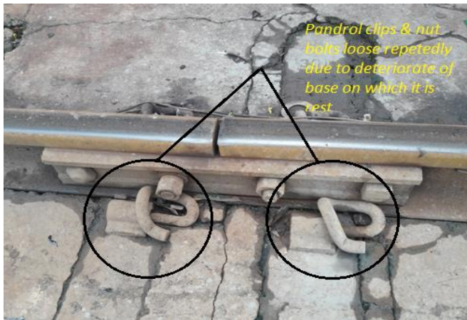
Fig.7 Repeatedly loosened fastener due to the deterioration of base on which it is rested upon.