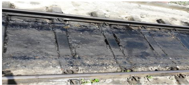
Fig.8 Oil and chemical attack on concrete

The chemical cause of concrete deterioration includes carbonation; sulphate attack and steel corrosion. Other factors contributing to concrete degradation include high structural stress, thermal stress, and shrinkage, poor quality of materials and workmanship and poor maintenance.