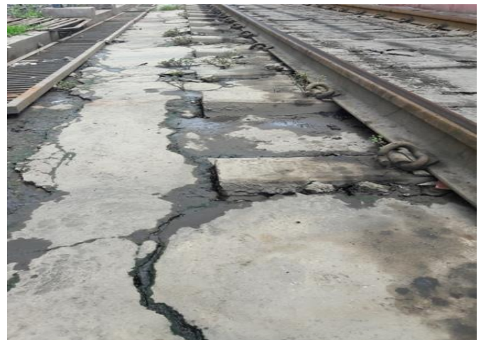
Fig.6 cracks in base slab of ballastless track

For Cast-in-situ BLT structure, concrete cracks not only harms the concrete, but also harms the conterminal part. Cracks in base slab is pathway to the water, immersing the water for a long time, the superstructure accelerates falling in, at the same time increase sedimentation value of base, thus affect the stability of base and reduce the durability and bearing capacity of base. Moreover, the cracks in base concrete aggravate corrosion of its steel.