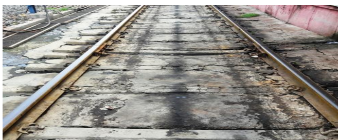
Fig.5 Cracks in frame of track slab

Cracks in the track slab will become entryway of the corrosion substances, Under the Cl^- or CO_2 environment. The steel in the slab will be corroded and the resulting expansion will aggravate the cracking of the concrete, sequentially reducing the durability of the concrete structure. Under movable load, concrete of track slab is easy to disintegrate and the sleeper rap, which affect the safety of the train. Some cracks lie in the range of fastener; leading to the loosening of the fasteners, thus affect track stability. In addition, there may be potential incipient fault of travel.