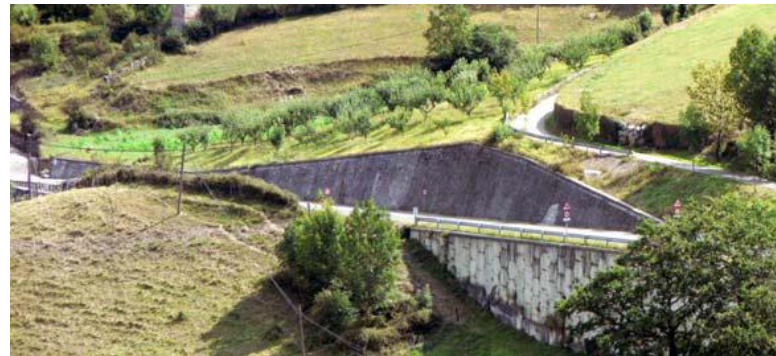
Fig.3. Precast concrete slab wall partially hidden behind a tree

structures, thus providing a sense of local character. Local stone walls easily integrate into road environment, and provide a natural and scenic view. Other solution is hiding these walls behind the trees that road's natural view can be preserved. The following picture shows a road whose embankment is supported by a precast concrete slab wall partially hidden behind a tree on the right side of the picture.