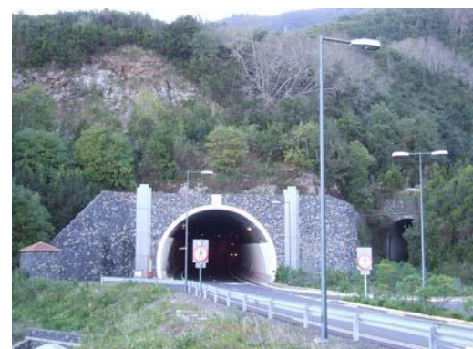
Fig.4. Structure covered by stone wall on the island of La Palma (Spain)

Tunnel entrances have a special effect in roads landscape views. By modifying their construction materials to more coordinate materials with their surrounding areas the harmony of roads and their environment can be provided. In some cases tunnels have to deal with rock collapses of the slope above their entrance, so they usually include special solutions for the slope surface, or protective structures in different shape and size, that the outer part of all of them can be changed and modified by coordinate materials to prepare a scenic view for road's users, (see Fig. 4).