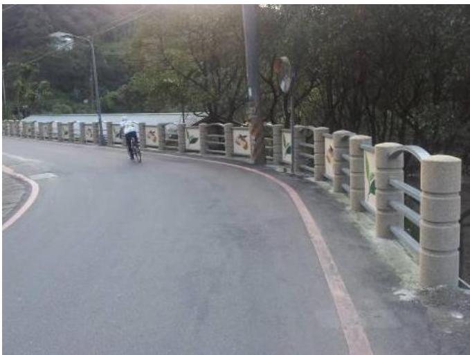
Fig.2. Traditional parapet

Roads prepare a natural view for the passengers. This modification in road's texture, provides a sense of naturalness and make these roads more pleasant for travel, (Fig. 2).