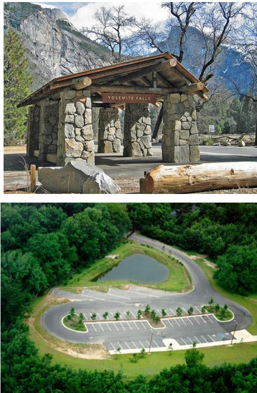
Fig.5. Parking area and bus stop suitable design with roads environment.

Parking areas must be safe to access and its location must be discreet. To make such a safe and separated place, that has adequate compatibility with road's environment, using trees and vegetation can be a helpful method. Also in bus stop design, utilization of suitable materials with roads landscape views like wooden materials can be useful in saving road's natural environment such as Fig 5 .