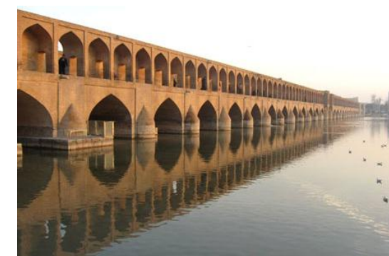
Si-o-se Pol Bridge (Isfahan,Iran)