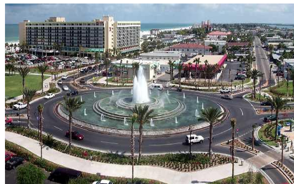
(b) Clearwater, Florida