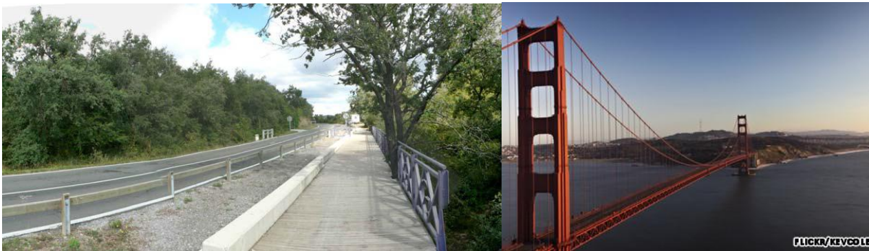
Fig.7. Separate bicycle lane, Safety barrier and low parapet separate pedestrians from traffic.