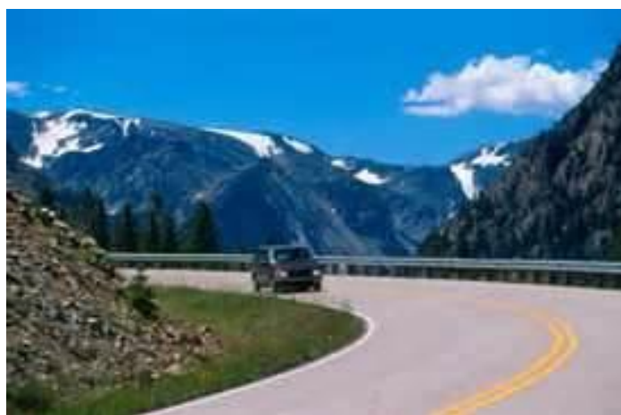
Fig-1: Road alignment leads the direction of sight to the landscape providing a fast succession of views

To achieve these desirable circumstances, road architecture design and its environment must be managed and take care, if changing the roads shapes and structures is not proper, using road marking must be considered. Picture 1 can help to understand this issue.