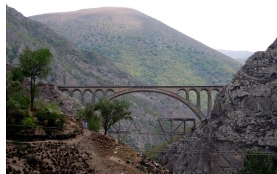
Veresk Bridge (Savadkuh,Iran)