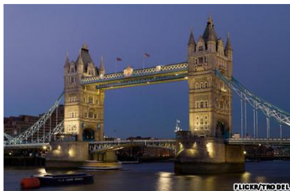
Golden Gate Bridge: San Francisco , United States

Thousands of tourists have crowded onto and around San Francisco's Golden Gate Bridge to celebrate the iconic structure's 75th birthday. Crowds partied across its three-kilometer length, boats cruised on the water below and a finale of fireworks lit up the San Franciscan sky. Some of the famous bridges around the world are illustrated in Fig 8.