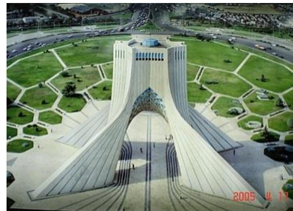
(a)Azadi Square Tehran (Iran)

Squares with their landscapes, beautiful fountains, historical structures and buildings inside them, and their monuments are one of the most popular symbols of the cities that show cultural and historical events of that city. Popular squares like Azadi square in Tehran (Iran), or Clearwater Square in Florida (USA) can be regarded as tourism attraction of these cities. (Fig 6)