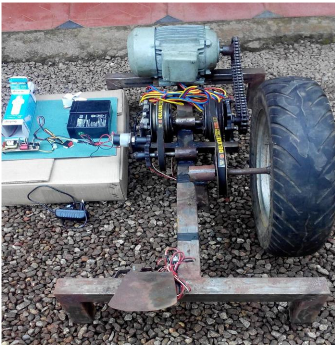
Fig.2: Final model of the concept