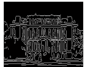
Fig (4) using Roberts