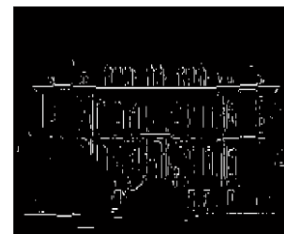
Fig(3) using Prewitt