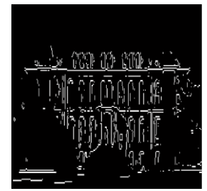
Fig(2) using Sobel