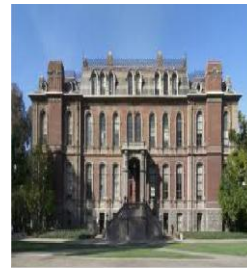
Fig (1) Original Image

Three most frequently used edge detection methods are used for comparison. These are Roberts Edge Detection, Sobel Edge Detection and Prewitt edge detection[7].