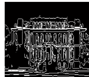
Fig (5) Fusion