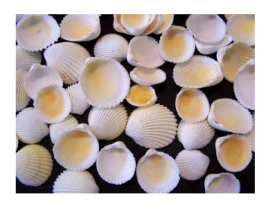
Fig -1: Cockle shell