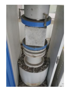
Fig -2 Compressive test on cube

Volume: 03 Issue: 06 | June-2016 www.irjet.net p-ISSN: 2395-0072