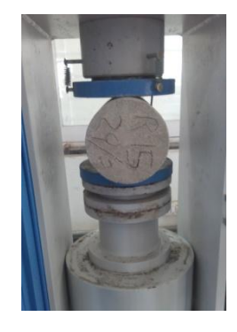
Fig -3 Tensile test on cylinder

The concrete is incredibly weak in tension due to its easily broken nature and it cannot resist the direct tension. The concrete develop cracks when load is subjected to tensile forces. Thus, it is essential to conclude the tensile strength of concrete at which the concrete member may crack. The split tensile strength of concrete cylinder is observed at 28 days of size 300mm * 150mm in diameter. Chart -2 shows the graphical image of split tensile strength.