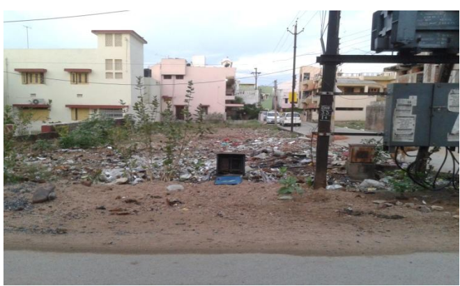
Waste littered on roadsides

Volume: 03 Issue: 06 | June-2016 www.irjet.net p-ISSN: 2395-0072