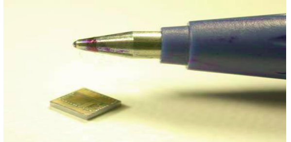
Fig -1 : The Size of the Smart dust

The "Smart dust" devices are small wireless microelectromechanical sensors (MEMS), these are used to sense everything from environment. The silicon and fabrication techniques, the "MOTES" are the size of a grain like sand; each of the grain particles contains sensors, computing circuits, and bidirectional wireless communications technology with a power supply system <sup>[1]</sup>. MOTES will gather the data and perform computations and communicate the information with adjacent MOTES using two-way band radio signals. The MOTES communicate with one other at approximately 1,000 feet of distance.