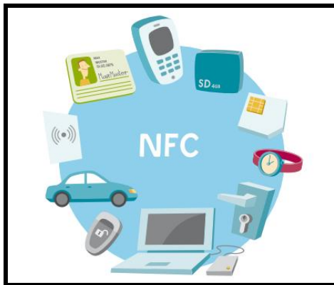
Fig -3: Components of an NFC ecosystem

NFC enabled SIM cards are to become a worldwide standard. The GSM Association has announced that a consortium has been formed and has committed to support and implement SIM cards, embedded with NFC. Both SIM and SD cards can be equipped with NFC chips and some companies are preparing to offer these options so large number of customers can start using NFC technology. For example, merely touching a film poster equipped with an NFC chip with an NFC capable device enables a trailer to be displayed and tickets to be reserved at the nearest cinema, shelves in the supermarket which are equipped with NFC provide information about the origin and treatment of fruit and vegetables, can indicate whether the engine oil is suitable for car. [7], [8]