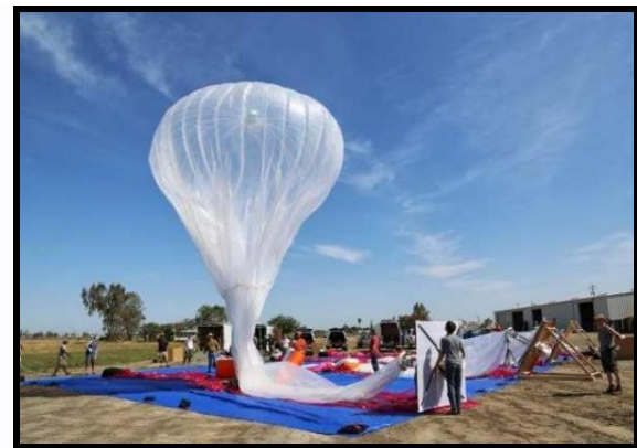
Fig -2: Google project Loon

A new project, the project Loon is proposed by Google that can provide internet access to remote and rural areas. It was launched in 2013. The Loon network, balloons travel around the Earth and bring access points to the users who cannot connect directly to the global wired Internet. Deployment of base stations for every location on the Earth seems to be impossible. It is a concept of providing Internet from the sky. Balloon network is formed in the sky that will transmit signals to nearest base stations and ISPs on earth. One balloon can provide connectivity to a ground area about 70 to 80 km in diameter using a wireless communications technology.