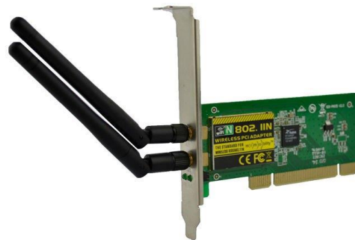
Figure 2: Wi-Fi Card .

You can think of Wi-Fi cards as being invisible cords that connect your computer to the antenna for a direct connection to the internet. Wi-Fi cards can be external or internal. If a Wi-Fi card is not installed in your computer, then you may purchase a USB antenna attachment and have it externally connect to your USB port, or have an antenna-equipped expansion card installed directly to the computer