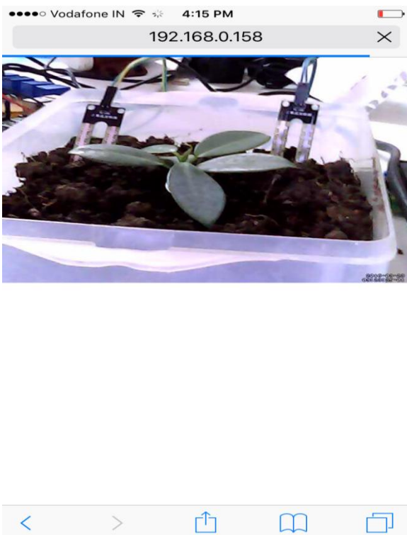
Fig 5: Image captured using mobile camera on wi-fi.

The following are the results obtained using web camera and sensors. Fig5 shows status of crops. Camera is interfaced with raspberry pi to capture the crop field and to observe the crops live by using wi-fi on android mobiles.