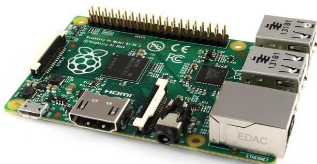
Fig 3 : Raspberry pi module

The Raspberry Pi is a small, powerful and lightweight ARM based computer which can do many of the things a desktop PC can do.