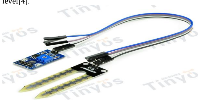
Fig 2: Soil Moisture Sensor

Sensors are the device which converts the physical parameter into the electric signal. The system consists of soil moisture sensor. The output of sensor is analog signal, the signal is converted into digital signal and then fed to the processor. The moisture sensor is used to measure the moisture content of the soil. Copper electrodes are used to sense the moisture content of soil. The conductivity between the electrodes helps to measure the moisture content level[4].