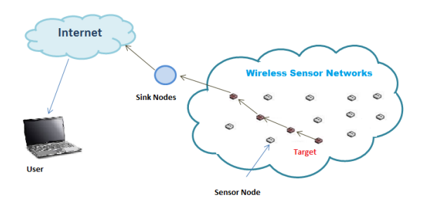
Fig -1: Wireless Sensor Networks

Localization in Wireless Sensor Networks (WSNs) is the most important issue and a very emerging field of research in WSNs. Many of the application such as underwater surveillance [6], military surveillance, traffic monitoring [7], habitat monitoring [8], forest fire detection [9], and flood detection [10] require location information. The WSNs consists of hundreds, thousands of low-cost and low-power