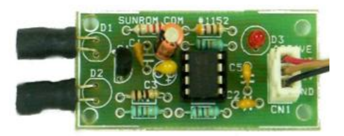
Fig-2: Obstacle Sensor

alarm systems, or contact less tachometer by measuring RPM of rotation objects like fan blades.