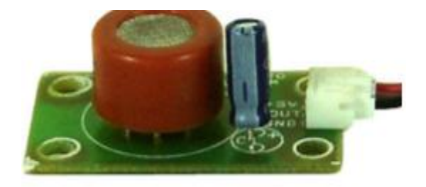
Fig-1: Alcohol Sensor

This alcohol sensor is suitable for detecting alcohol concentration on your breath, just like your common breathalyzer. It has a high sensitivity and fast response time. Sensor provides an analog output based on alcohol concentration.