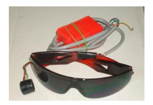
Fig-3: Eye Blink Sensor

This Eye Blink sensor is IR based. The Variation Across the eye will vary as per eye blink. If the eye is closed means the output is high otherwise output is low. This to know the eye is closing or opening position. This output is give to logic circuit to indicate the alarm. This can be used for project involves controlling accident due to unconscious through Eye blink.