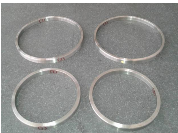
Fig 3.3.3: Guide Rings