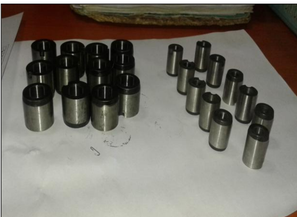
Fig 3.3.2: Drill Bushes