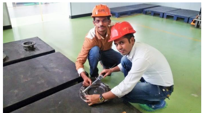
Fig 3.3.6: While doing inspection of acrylic jig