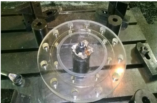
Fig 3.3.1: Machining of acrylic plate

Following photographs shows the manufacturing of Acrylic jig. Jig was manufactured at in house of Kirloskar Ebara Pumps Ltd.