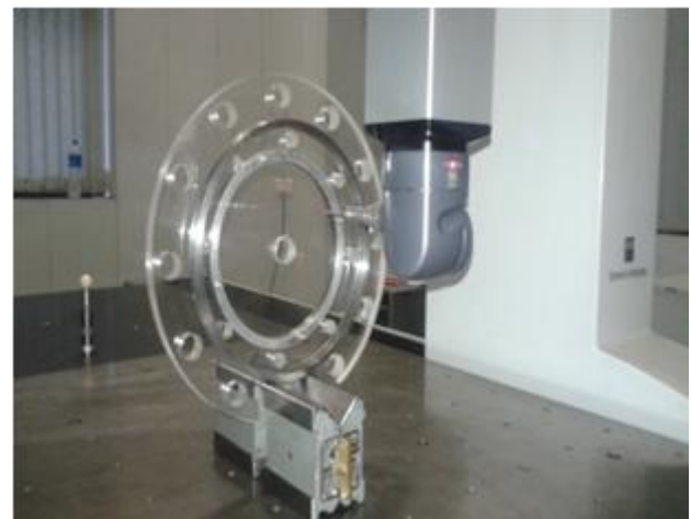
Fig3.3.5: Inspection of Acrylic on CMM (Co-ordinate Measuring Machine)