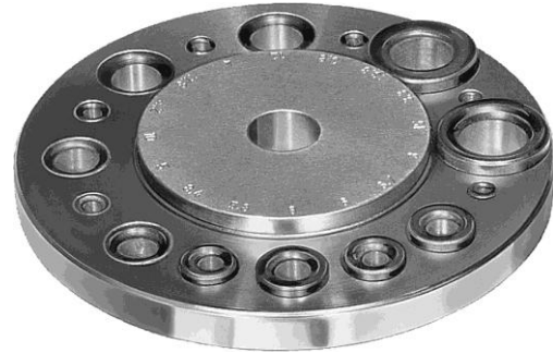
Fig 3.2.1: Traditional jig

As per the traditional method mild steel and cast iron material were used for manufacturing of jigs. This jig is difficult for handling for the workers. Also the cost of manufacturing of this metallic jig is more