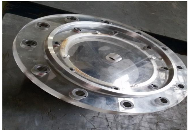
Fig 3.3.4: Assembly of Jig Plate