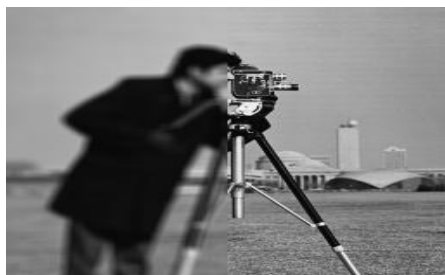
Fig.4 "Right focused image"