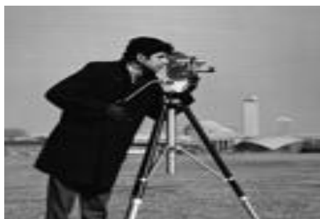
Fig.5 "Fused image"

The table 1 shows the parameter values which are calculated in MATLAB for fused image. Table 2 shows parameter values of fused images and source images and compare that values for showing fused image has better parameters than source images.