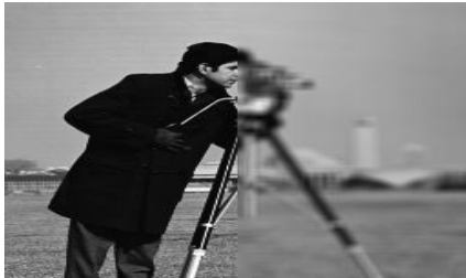
Fig.3 "Left focused image"

The variance method is used to image fusion. The fig. 3 shows left focused image and fig.4 shows right focused image. By using proposed method the fused image of these both images is shown in fig.5. The fused image parameters also calculated.