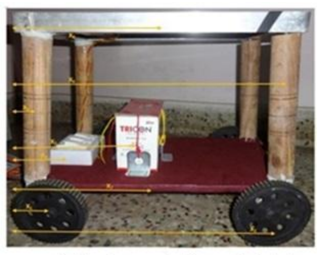
Position of components with respect to back plane

(\mathbf{Y}) = \frac{1133340}{6266} = 180.87 \, mm