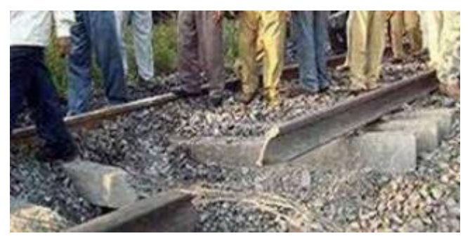
Fig -1: Crack in the railway track

implemented using simple components Microcontroller (renesas RL78), LED, LDR, GSM, GPS module, 4 wheel robot. The LED-LDR monitors the cracks in the rails, GPS detects current location, to receive information GSM is utilized, the robot is driven by dc motors on railway tracks.