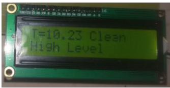
Figure 3 LCD display unit.