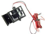
Figure 4 Magnetic float sensor.

Specifications: Level measurement type – High/ low. Switching capacity – 10W Switching voltage – 0.5 Amp.max. Switching voltage – 25v DC max. Cable – two cores