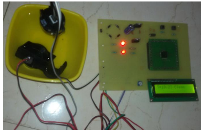
Figure 7 Hardware setup .