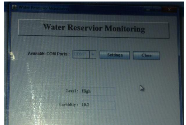
Figure 6 Displaying Turbidity sensor and level sensor values.