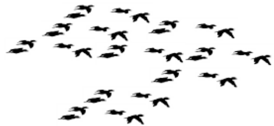
Fig 3: particle swarm based bird optimization

It is a famous SI-inspired technique which is stimulated by the social deeds of the species, e.g. swarm of birds, fish school [19]. Figure 3 depicts a pattern of particle swarm based bird optimization.