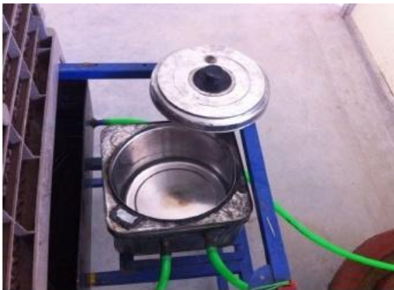
Figure: 2 Cold Storage Box

A cold storage box is provided for getting cooling effects. It is used for storing perishable items. It is made of steel material as it has good thermal conductivity. It is a hollow box and the cold water is made to flow in the hollow space. One face of the box has a door from where the box can be filled. The capacity of the box is 15-20 liters. The cold storage box is converted by a thermocollyor to avoid a heat losses