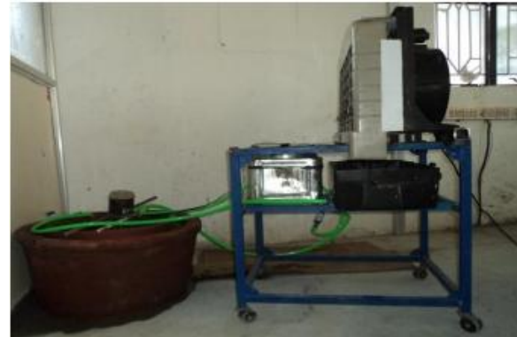
Figure 3: Fabrication model

back to the lower tank. The components are connected to each other by the help of connecting pipes which are made of polymers to avoid heat losses. Fig. 4 shows the fabricated working model of the proposed system.