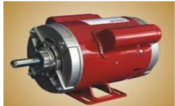
Fig -1: Electric Motor

Electric motor is an electrical machine that is used to convert electrical energy into mechanical energy. For smaller loads as in household application. Although traditionally used in fixed-speed service, induction motors are increasingly being used with variable-frequency drives in variable-speed service. VFDs offer especially important energy savings opportunities for existing and prospective induction motors in variable-torque centrifugal fan, pump and compressor applications.