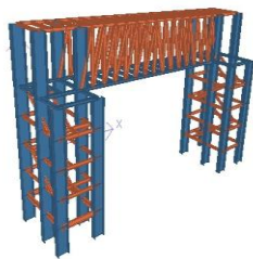
Fig 1-Design of steel footover bridge using STAAD pro

Steel can be more effectively protected using simple hand methods of brushing or spraying and therefore steel bridges are likely to have a longer life and lower maintenance costs than timber bridges. Steel truss bridges are more straightforward to fabricate than timber truss bridges and are likely to be more appropriate for spans of intermediate length.