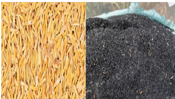
Figure 1 - Rice Husk and Rice Husk Ash