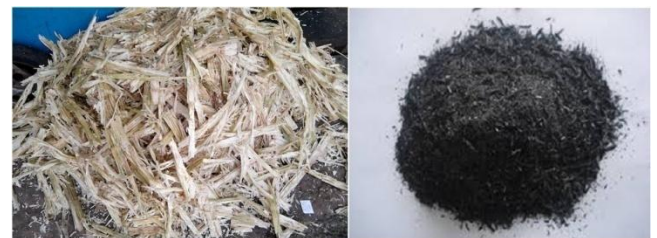
Figure 2 - Sugarcane Bassage And Sugarcanebassage Ash