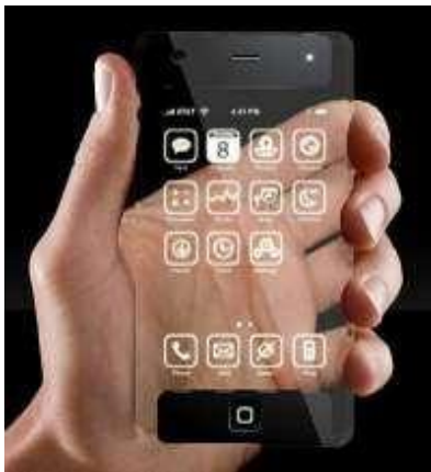
Fig.2: 5G Mobile