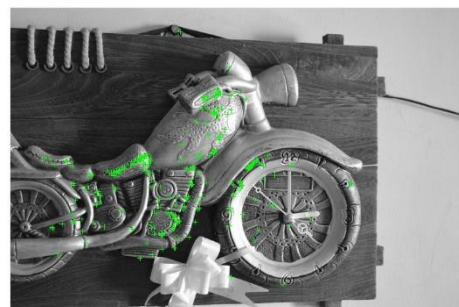
Figure 4.4: Harris Corner Detection