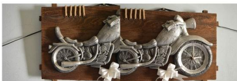
Figure 4.2: Images Acquired With Camera Rotation

The first step of any image vision system is image acquisition. Image acquisition [18] can be broadly be defines as the action of retrieving an image from some sources. Typically, the images required for image stitching can be acquired by three different methods. These methods include translating a camera parallel to the scene, rotating a camera about its vertical axis by keeping the optical centre fixed or by a handheld camera. The acquired images are assumed to have enough overlapping that the stitching can be done and also some other camera parameters are known.