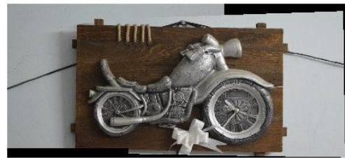
Figure 4.6: Final Stitched Panorama Image

Feathering image blending is a technique used in computer graphics software to smooth or blur the edges of a feature; it is the simplest approach, in which the pixel values in the blended regions are weighted average from the two overlapping images[20]. Sometimes this simple approach doesn't work well (for example in the presence of exposure differences). But if all the images were taken at the same time and using high quality tripods, therefore, this simple algorithm produces excellent results.