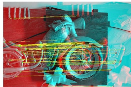
Figure 4.5: Feature Matching Between Two Images

A disadvantage of RANSAC is that there is no upper bound on the time it takes to compute these parameters. When the number of iterations computed is limited, the solution may not be optimal and it may not even be one that fits the data in a good way.