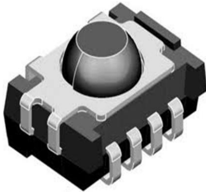
Fig-4.2: Electronic infra-red sensor

IR (Infrared) sensors use infrared light to sense any obstacle in front of them and gauge their distance. The commonly used IR sensor have an emitter and a detector. A pulse of infrared light is emitted from the emitter and spreads out in a large arc. If no any obstacle is detected then the IR light continues forever. However, if any obstacle is nearby then the IR light will be reflected and some of it will hit the detector. The detector is able to detect the angle that the IR light arrived back and thus can determine the distance to the obstacle.