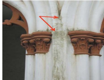
Fig-2: Arrows indicating Mold stains [2]

identified several problems such as spalled plaster, fungus growth in walls, cracks in the ceiling and masonry walls, corrosion and spalling of concrete in columns. These are mainly caused by severe water leakages and environmental distress [3].