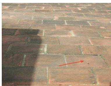
Fig-5: Cracks at roof surface [4]

Moreover, Abdul Rehman intended his case study on three historic buildings namely the Sholamur garden, Shish mahal and Jahangir tomb which were built in the year 1640, located at Lahore. He underwent various defects in the building such as, severe damage of perimeter wall, deterioration of beams caused due to termite attack and seepage of water from the roof. Stones in the tomb got deteriorated due to fungus, moisture content and air pollution. Bricks on edge pavements were damaged. Growth of vegetation was also found on the rear side of the building [8].