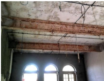
Fig-1: Roof leakages [1]

Secondly, C.Natarajan, et al reports the Rehabilitation of St. Lourdes Church, Tiruchirapalli which was built in the year 1890. The author faced various problems such as mold stains and water damage, cracks in the outer brick surface and decay of bricks in the inner surface and erosion on the roof surface. These are also caused due to poor waterproofing, seepage of water and water logging [2].