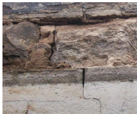
Fig-3: Vertical cracks and gaps [1]

Moreover, Nur Liyana Othman et al, proposed their case study in a hospital building named Sultanah Bahiyah located at Alor setar. They inspected several issues such as leakages at ceilings and watermarks, black staining in walls and dampness, corrosion at roof gutter. These are caused due to entry of rainwater through louvers due to shortness of awning, water seepage from toilet area and environmental factors [5].