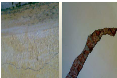
Fig-4: Cracks in ceilings and walls [3]

James S Cohen, intended his Rehabilitation work on a historic building located in Circa, built in the year 1862. He identified several drawbacks in the building such as two facades in the front side were collapsed, vegetative growth at rear side of the building [7].