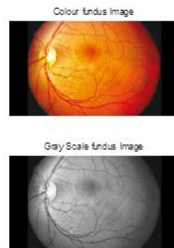
Figure 5.3. Conversions into Grayscale Image

Many image editing programs allow you to convert a color image to black and white, or grayscale. This process removes all color information, leaving only the luminance of each pixel. Since digital images are displayed using a combination of red, green, and blue (RGB) colors, each pixel has three separate luminance values. Therefore, these three values must be combined into a single value when removing color from an image. There are several ways to do this. One option is to average all luminance values for each pixel. Another method involves keeping only the luminance values from the red, green, or blue channel. Some programs provide other custom grayscale conversion algorithms that allow you to generate a black and white image with the appearance you prefer. The figures shows the conversions of retinal images by using MATLAB.