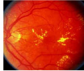
Figure 1: Digital Color Retinal Image

Image processing play a vital role in blood vessel extraction from the fundus image. In an automated retinal image analysis system, exact detection of optic disc in colour retinal images is a significant task. The information obtained from the examination of retinal blood vessels offers many useful parameters for the diagnosis or evaluation of ocular or systemic diseases. For example, the retinal blood vessel has shown some morphological changes such as diameter, length, branching angles or tortuosity for vascular or nonvascular pathology, such as hypertension, diabetes, cardiovascular diseases. In colour fundus image shown in Figure 1, optic disc appears as a bright spot of circular or elliptical shape, interrupted by the outgoing vessels. It is seen that optic nerves and blood vessels emerge into the retina through optic disc. Therefore it is also called the blind spot. Detection of the same is the prerequisite for the segmentation of other normal and pathological features in the retina. The location of optic disc is used as a reference length for measuring distances in these images, especially for locating the macula.