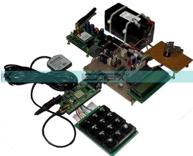
Figure 2: GPS and GSM Based Vehicle Theft Intimation

This GSM based vehicle theft control system retrieves the exact location of a vehicle in terms of its longitude and latitude. This data is fed to the microcontroller, which is interfaced to a GSM modem. The microcontroller retrieves the exact location details from the GPS and sends an SMS to the concerned authority over GSM modem on periodical intervals which is set by the user. An LCD display is connected to the microcontroller for crossing the data received before being sent over GSM. This project will be very useful to people to keep track of their vehicles. Further, this project can be developed by making an arrangement to stop the ignition of the vehicle by the owner remotely by sending an SMS in theft situations.