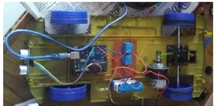
Fig -3: Tested in Model Car