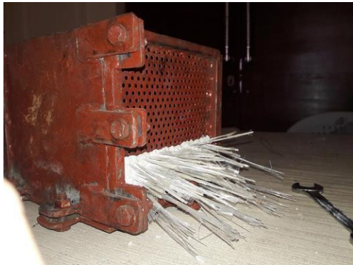
Fig2 Embedding optical fibre in formwork

In this method special formwork is to be made by drilling holes on any two opposite sides. Sides of formwork are then assembled on a base plate. The plate should be cleaned and oiled properly and then optical fibres are passed through the holes. Optical fibres are clamped on both the sides keeping the optical fibre in slight tension. Concrete mixture is then poured slowly into the formwork. During the process of casting concrete, the formwork is placed on vibrating machine in order to prevent air voids between optical fibre and concrete mixture, the concrete is now allowed to set for 24 hours and then formwork is removed and further curing process is carried out on the concrete block. Sides of the concrete block are polished for more aesthetical look.