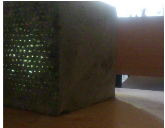
Fig4 Light Transmitting Concrete