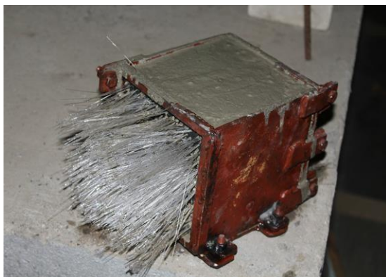
Fig3 Casting of concrete block

In this method special formwork is to be made by drilling holes on any two opposite sides. Sides of formwork are then assembled on a base plate. The plate should be cleaned and oiled properly and then optical fibres are passed through the holes. Optical fibres are clamped on both the sides keeping the optical fibre in slight tension. Concrete mixture is then poured slowly into the formwork. During the process of casting concrete, the formwork is placed on vibrating machine in order to prevent air voids between optical fibre and concrete mixture, the concrete is now allowed to set for 24 hours and then formwork is removed and further curing process is carried out on the concrete block. Sides of the concrete block are polished for more aesthetical look.