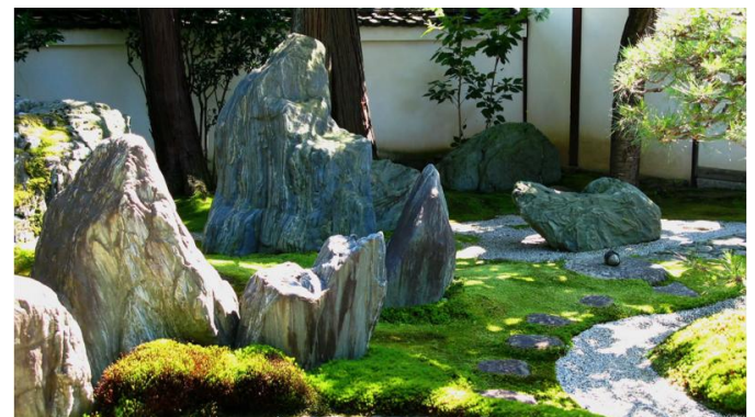
Fig -4: Japanese garden in shigemori museum of garden art [4].

In addition, Ikebana: the Japanese art of flower arrangement is an art form within certain rules for arrangement, where nature and humanity are brought