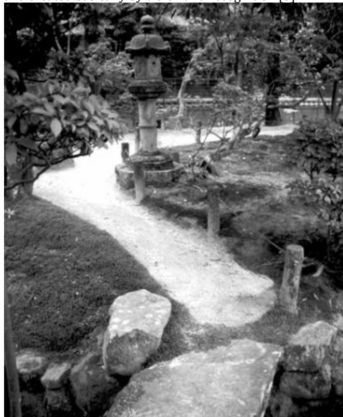
Fig -2: Oku; the visitor's sense of depth is reinforced by the fact that the approach is not straight but winding. The curve affords alternating viewing points and locomotion [4].

Another example is wrapping sushi, the Japanese food is prepared differently, when open (wrap sushi) can touch the