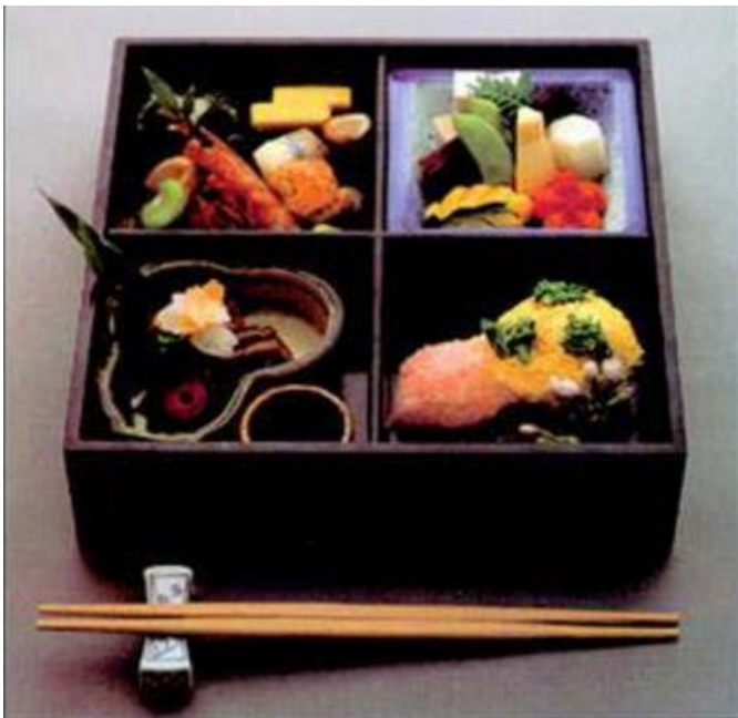
Fig -8: The aesthetics of the Japanese lunch box [9].