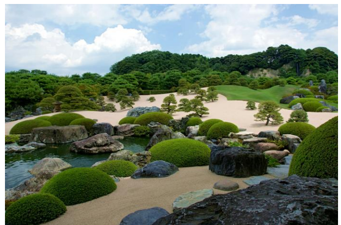
Fig -7: Public Japanese garden in the adachi museum of art [4].

One aspect of the Japanese traditional culture is the traditional art performances, which are very popular. They include Art Theater and musical theater which reflect the aesthetic dimension. There are various rituals aesthetic daily which we don't find emphasis on them, such as ceremonies, and funerals, which express religious commitments toward life, nonetheless plays a crucial role in various cultural practices. The religious life in Japan is the life of long history of interaction between religious traditions and customs. And include Shinto or Buddhism [8]. It is the aesthetics of Japanese daily activities, known as functional spaces, that is flexible in providing Japanese food which give beauty, taste and texture for things. For example, the lunch box in the Japanese kitchen, where meals are served once in a single panel and various forms. In the lunch box there are voids of space divided in different forms. This difference gives us the flexibility and functionality, as well as the balance between parts, which increases the joy and anticipation when you open the lid. This is known as the spatial arrangement [3], as seen in figure 8. Another example is knives. "That the aesthetic value of a knife consists not only of its visual qualities and its feel in my hand, determined by its surface texture, weight, and balance but, most importantly, by how smoothly and effortlessly can cut an object with it" [8].