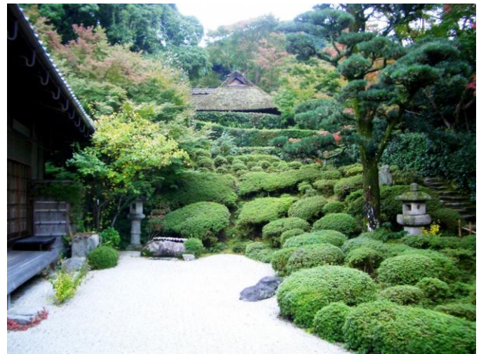
Fig -6: An example of tea house garden [4].