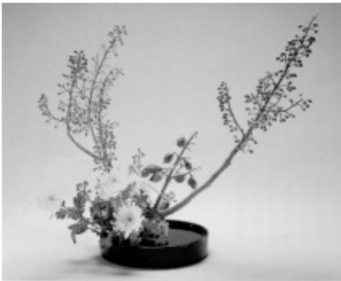
Fig -5: Basic style Ikebana [7].

together. It is the philosophy of developing a closeness with nature, which is a creative expression and the meaning latent in the total form of the flower arrangement by creating a link between the indoors and the outdoors. The art of flower arrangement in Japan is an important aspect, there are many ways of coordinating the flowers, and that lies behind each of them has different philosophy and method [1], as seen in figure 5.