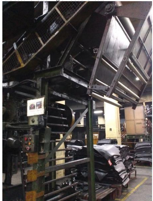
Fig -2 stacking

It is used for stacking of rubber sheets