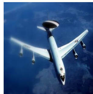
Figure 2 .image2