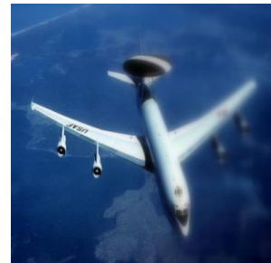
Figure 1.image 1

Image fusion is referred to as the process of obtaining a superior image from the input images by extracting certain features of the input images. Basic objective of fusion is obtaining more informative and better quality image than the input images.