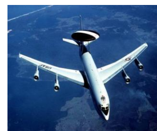
Figure 3 . fused image