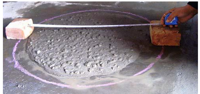
Fig -1: Slump flow test

Key Words: Self compacting concrete, Steel fiber, Superplasticizer, Compressive strength, Durability.