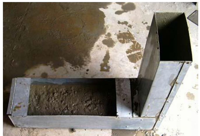
Fig -3: L- Box test