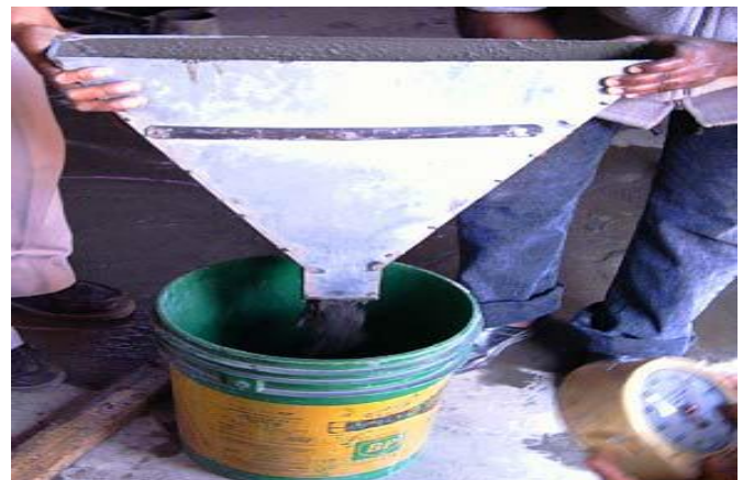
Fig -2: V-Funnel Test

The Self compacting concrete (SCC) was first developed in Japan in 1988 to achieve durable concrete structures. SCC is described as the most revolutionary development in concrete construction for several decades. Originally developed due to shortage of skilled labour, it is economically because of a number of factors, such as: faster construction, reduction in site manpower, better surface finishes, easier placing, improved durability, greater freedom in design, thinner concrete sections, reduced noise levels, absence of vibration and safer working environment [1]. The successful development of Self compacting Concrete must ensure a good balance between stability and deformability. Researchers have set some guidelines and tests such as Slump flow shown in Fig.-1, V-Funnel test shown in Fig.-2 and L-Box test shown in Fig.-3 for mixture proportioning of SCC, which include reducing the volume ratio of aggregate to cementitious material, increasing the paste volume, water-powder ratio (w/p), carefully controlling maximum coarse aggregate particle size, total volume and using various viscosity modifying agent (VMA).