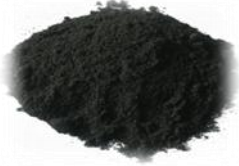
Fig: 1.6 Crumb Rubbers

with 30 holes per inch resulting in rubber granulate that is slightly less than 1/30th of an inch.