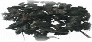
Fig: 1.7 Shredded Rubber

This fine grade reclaim rubber product is manufactured from whole tyre scrap. These are the used tires from passenger car used tyres, primary shred size of pieces from 30cm and below, the shred is the primary cut of used tires produced by elden primary chopper, container 40 ft load with 25 tons