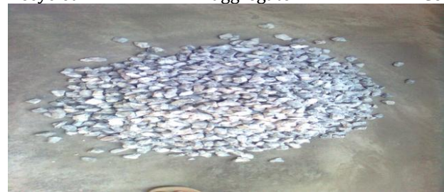
Figure no. 1.5 Recycled Aggregate.

Recycled aggregate is generally produced by two stages crushing of demolished concrete, screening and removal of contaminants such as reinforcement, wood, plastic etc. Concrete made with such aggregates is called as Recycled aggregate Concrete.