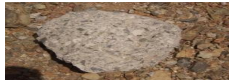
Fig: 1.2 Concrete Rebar

Demolition of old and deteriorated building and traffic infrastructure and their substitution with new ones, is a frequent phenomenon today in most of the part of world. The main reason for this situation are changes of purpose, structural deterioration, rearrangement of city, expansion of traffic directions and increase of traffic load, natural disasters like earthquake, flood fire etc. As per Times of India, Dec 6, 2010 states that according to JNNURM report India generates 10-12 million tons of C& D waste annually. And 50% of it is Concrete and Masonry which is not recycled in India. The most common methods of disposing this material are land filling. In these way large amounts of construction waste is generated, consequently becoming a problem a special problem of human environment. For this similar reason in developing countries, laws have been bought into practice to restrict this waste in the form of prohibitions or special taxes existing for creating waste areas. To take care of the C& D waste in India Ministry of Environment and forests has mandated environmental clearance for all large construction projects. The figure 1.1 and figure 1.2 below shows the C&D Waste and Concrete Rebar which are the main source for recycled concrete aggregates.