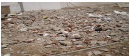
Fig: 1.1 Demolished Waste

Advantages: Environmental gain, Save Energy Cost, Sustainability, Wide Market.