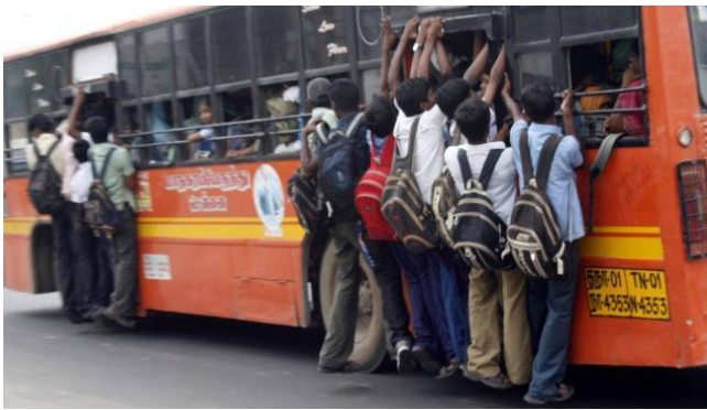
Fig 3.2. Unsafe transportation in Cities.