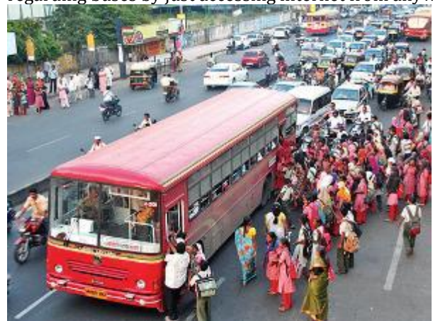
Fig 3.1. Unnassary crowding at bus stop.

Also people can come to know about the information regarding buses by just accessing internet from anywhere.