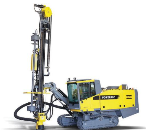
Fig.1 : PowerROC D40