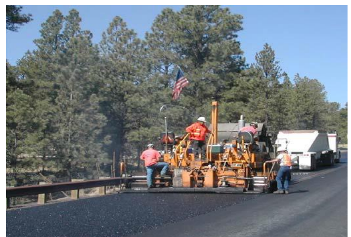
Fig -6: Rubberised bitumen construction