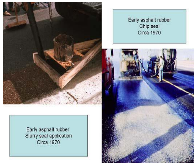
Fig -2: Rubberised bitumen applied as a slurry seal