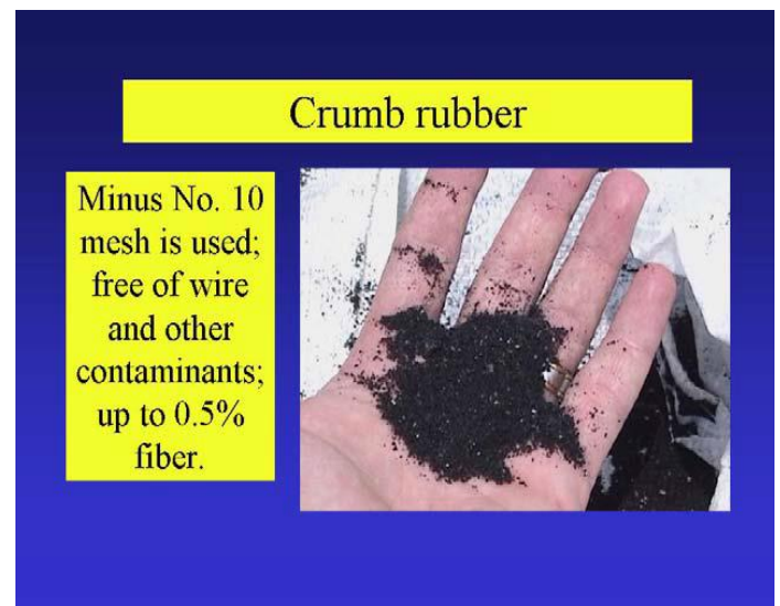
Fig -5: Crumb rubber

Construction of an AR pavement involves first mixing and fully reacting the crumb rubber with the hot bitumen as required by specification. Typically 20 percent ground tyre rubber that meets the gradation shown in Table 1 and is added to the hot base bitumen. The bitumen needs to have a temperature of about 177°C (about 350°F) before being put into the blending unit, that heats the bitumen to 191°C to 218°C (375°F to 425°F) just prior to adding the rubber particles. The rubber and bitumen are mixed for at least one hour. After reaction, the rubberised bitumen mixture is kept at a temperature of between 163°C and 191°C (325°F and 375°F) until it is introduced into the mixing plant. Samples of the rubber, base bitumen, and AR mixture are taken and tested accordingly. The ARFC, which typically has one percent lime added to the mix, is placed with a conventional laydown machine and immediately rolled with a steel wheel roller.