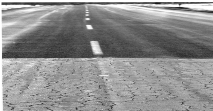
Fig -4: Rubberised bitumen chip seal applied to badly cracked pavement