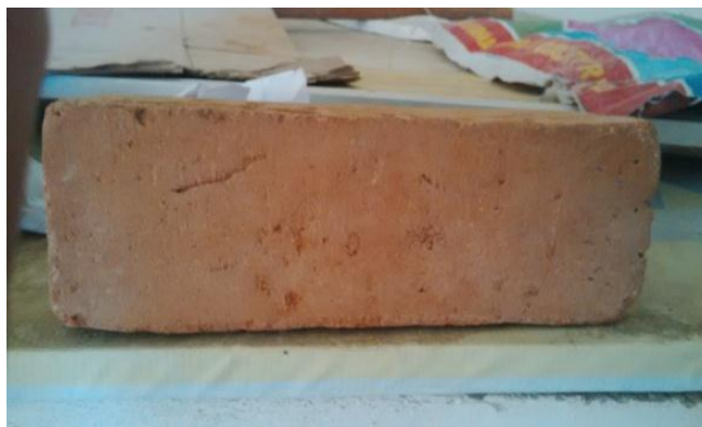
Figure- 9: Mild Efflorescence