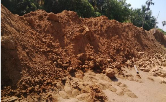
Figure- 3: Clay preparation