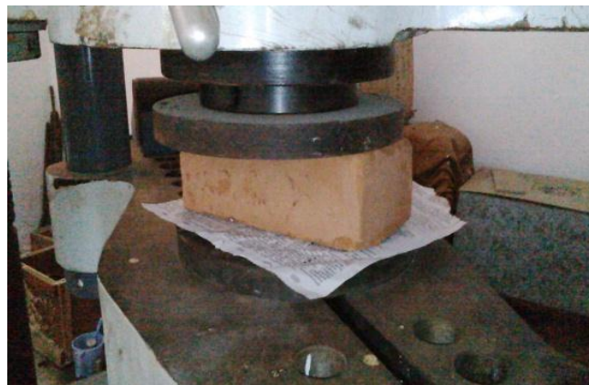
Figure- 7: Compressive strength in UTM