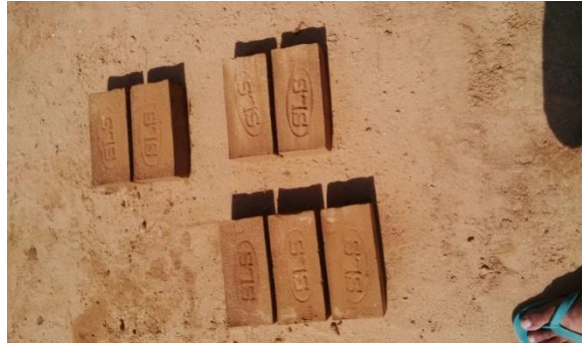
Figure- 4: Bricks kept for drying under natural sun light after moulding