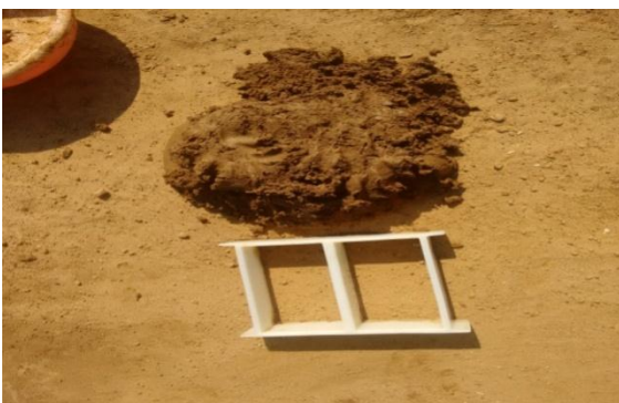
Figure- 1: Plastic mould

Debris is collected from the demolished sites. The concrete debris is crushed and then the debris was sieved using 1.18mm, 600 microns, 300 microns & PAN. The debris was then weighed and packed in ratios of 10% (400 gms), 20% (800 gms), and 40% (1600 gms) taking the total weight of a brick as 4.0kgs.