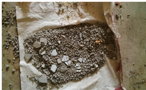
Figure- 2: Concrete waste being crushed