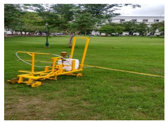
Fig -1: Developed project

Initially frame is fabricated and tank is fitted on its front side. Then four wheels and handle are attached to it to make the system stable and horizontal. Then Pump is attached to its frame at certain height and according to length if piston then cam mechanism is adjusted to make its proper alignment. Now fifth wheel is freely located on frame with help of its handle. Then transmission chain is fitted on it so that power from free fifth wheel gets transferred to cam mechanism which in turns transferred to pump. Now intake to pump is taken from storage tank through pipe with filter. And output of this pump is given to nozzles through pipe mechanism through clutch system as shown in figure 1 and figure 2.