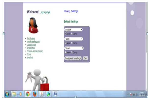
Fig 2:privacy settings: