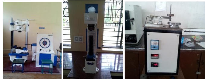
Fig 6: Testing Machines for varies test

By wear test, the wear rates of the testing specimens were calculated by the weight loss technique. Pin – on – apparatus is used to conduct wear test (dry sliding) wear test apparatus of cylindrical pin specimens of 10mm diameter and 30mm length against a steel disc at different load with constant load and speed.