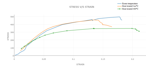
Fig 5 Graph of Stress v/s strain

From the above table it shows that the specimen of heat treated 400°C, here load increases up to deformation value of 4.02 and its load is 246.3 KN. After this load decreases gradually. At load 220.17 KN specimen breaks. And its deformation was 6.34. This heat treated 400°C shows that heat treated specimen of highest temperature having higher stiffness than above two materials.