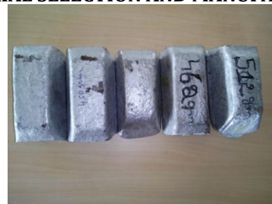
Fig 1: Aluminium