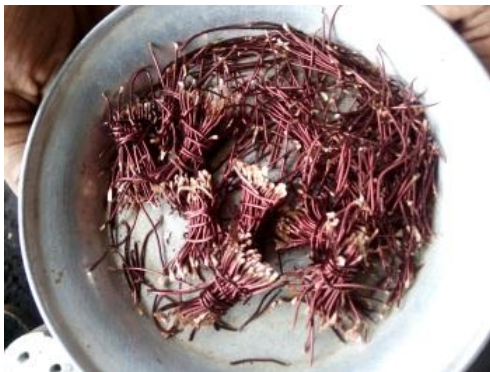
Fig 2: Copper

Aluminium is a light weight and low density and its corrosion resistance is very high as compared to steel and other metals. It is a strong to mass ratio, and high reflective. Aluminium exhibits high strength at room temperature. For electrical power, and heating coil, aluminium is used because it is a good electrical and thermal conductor. Because of non-ferromagnetic behaviour exerted by aluminum, the application is widely usages in electrical and electronic industries. Because of no poisonous behaviour exerted by aluminium, it is also used in medical, food, and other carriage items.