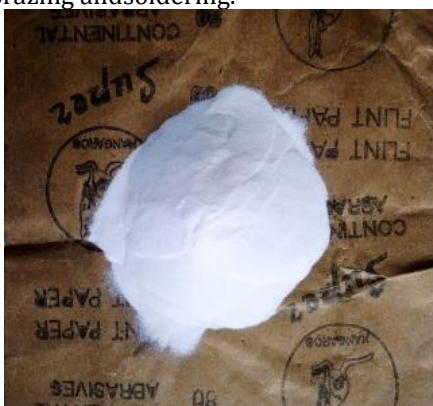
Fig 3: Alumina

It exhibits behavior in softness, malleability and ductility characteristics. Copper turns into white colour when it undergoes oxidation. The important properties of copper are copper is an excellently conducting electricity, heat carrier. It is characterized with good resistance of corrosion, and excellent machining, and has high stiffness. And it is characterized with good and easily we can fabricate material. Copper is a nonferrous material, so it cannot behave like a magnet. Copper is a soft material so copper is used as a welding, brazing and soldering.