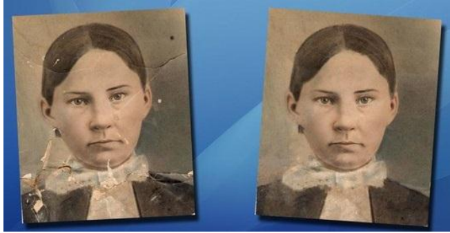
Fig-1.2: Example of manual inpainting<sup>[10]</sup>

It is very well acknowledged that the inpainting (also known as image interpolation or video interpolation) in the digital planet refers to the function of sophisticated algorithms to reinstate damaged parts of the image data, mainly the miniature portions, regions or to remove modest defects. In a easy manner we can say that image inpainting is the collective name under which all related method renovate or reconstructing misplaced parts of an image by using information in pixels surrounding the holes or damaged segment in image inpainting domain. The ambition of the image inpainting is not to recover the accurately same as original image but try to create image that has a close resemblance with inventive image