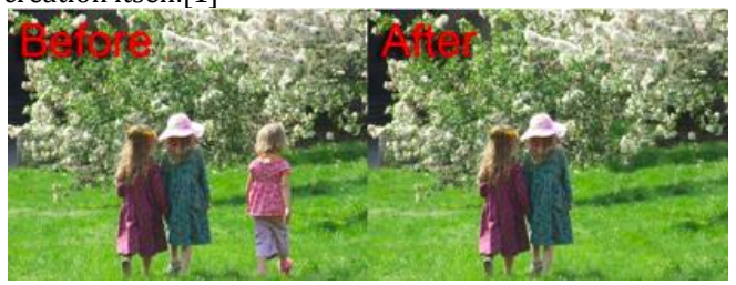
Fig- 1.1: Image Inpainting Example<sup>[5]</sup>

Image inpainting is the study area in the field of image processing whose objective is to take away some items or reinstate the broken regions in a way that observer cannot notice the flaw[8]. The filling of misplaced information is essential in image processing, with application as well as image coding and wireless image transmission, special effects and image restoration. The essential idea at the back of the algorithms that have been planned in the creative writing is to fill-in these regions with available information from their environment. The modification of images in a way that is non-detectable for an witness who do not be acquainted with the original image is a practice as older as inventive creation itself.[1]