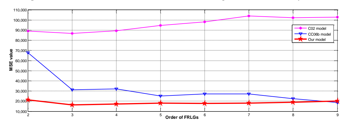
Fig. 2: A comparison of the MSE values for different intervals with the high-order FTS model.