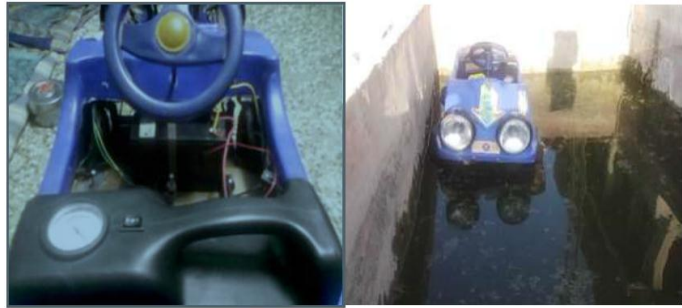
Fig. 9 Demonstration of working

battery by connecting to ac supply. It requires 12 hrs to completely charge the battery.