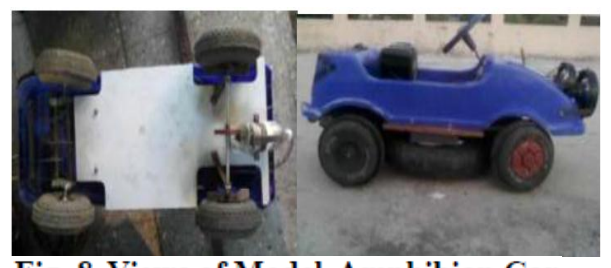
Fig. 8 Views of Model Amphibian Car There are two blades (fans) each of them having four plates used in amphibian car. These are circular in shapewith some inclination. The diameter of the blades is slightly less than that of diameter of wheel, as the car hasthe front engine

The Amphibian car consists of following part:-TubeThe tube is located at the bottom side of the car frame or chassis. It has two valves are provided, one is to fillthe air in tube and the other is for outlet valve to exhaust the air. When we want the car to run on the water thenair filler machine is started for the filling the air in tube. Thus the tube is filled by air which will help the car tofloat on water and also carry the weight of car. Thus the tube serves the function that it help to float the car onwater. The tube is manufacture of some special material which will not puncture easily.