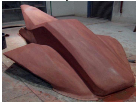
Figure 7: Surface finishing of the Bodywork

Next, demolding process is executed to separate the product and mold. Demolding process must be done carefully to avoid defects in the product. The next process is the surface finishing stage. Car body filler putty and sand paper is used to gain smooth and continuous surface finishing. The final finishing can be observed in Figure