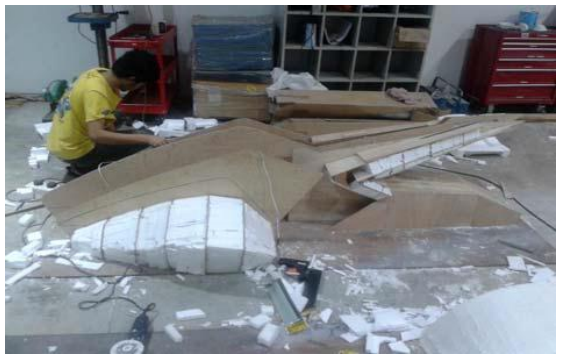
Figure 5: Molding process

Molding process is the most important stage where at this stage the quality of mold will influence the end product of the quality. A good quality of mold will quicker the time forsurface finishing. The mold is made up from plywood which is use as a bone of the mold. Polystyrene is then applied to fill the empty space in the molding body. Wall filler will be used to fill pores of the molding surface and it will be sanding using sand paper to refine the surface finishing of mold.