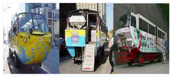
Fig. 4 Amphibious buses

Amphibious buses are employed in some locations as a tourist attraction. A recent design is the AmphiCoach GTS-1.