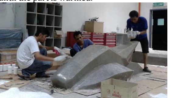
Figure 6: Hand layup technique

As the mould is completed, the glass fiber which is from chop strand mat and woven fabrics are used to fabricate the body by using hand layup technique. Figure 6 show the process of hand layup techniques. A release agent, liquid of wax form will be applied onto the mold. This allowed the finished product to be removed cleanly from the moldwithout any sticking problem that will affect the finished product quality. After the release agent have been applied to the entire surface mold, resin mixture which is consisting of polyester resin, epoxy type of resin is mixed together with its hardener and applied to the surface of the mold. Sheets of fibreglass cloth are cuts and lay onto the mold, and then more resin mixture is added using brush a brush or roller. It is important to ensure that no air is trapped between the fiberglass clothed and mold and roller is used to remove the air pockets by pushing out the air pockets away from the fiberglass layer. Air pockets will cause fibreglass strength weaker. To add more layer of fiberglass, additional resin is applied and possibly sheets of fiberglass cloth also applied onto it. To make sure the resin is saturates evenly and air pockets are removed, hand pressure and roller are used. The work is executed quickly enough to complete the job before resin starts to cure, unless high temperature resins are which will not cure until the part is warmed.