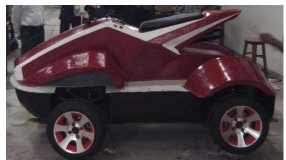
Figure 8: Shows the final bodywork for the UTeM's AHV.

Amphibious Hybrid Vehicle is shown in Figure