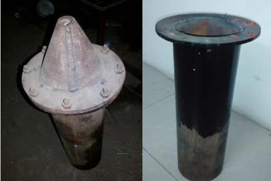
Fig -3: Heating Chamber

The heating chamber is the most important component of the setup as it has to sustain the heat generated by the furnace and also be free of any leakage. The heating chamber basically consists of two main parts, the conical section with a flange and the pipe with a flange. The pipe has an outer diameter of 14 cm and a length of 50 cm. The thickness of the material used is 4.5 mm.