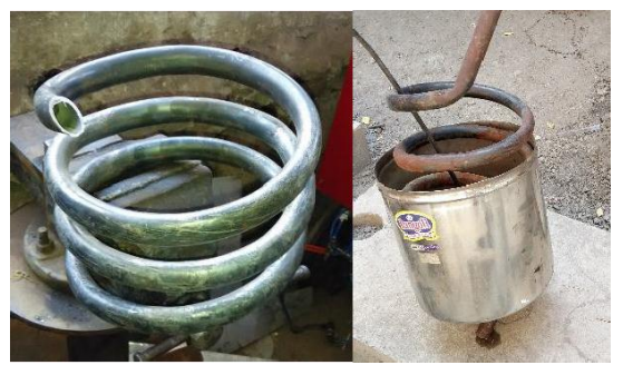
Fig -4: Heat Exchanger

A helical coil heat exchanger consists of a pipe passing through a tank containing water. A standard mild steel pipe of 1 inch diameter and 2.8 m length was bent to fabricate a helical coil pipe using hot working.