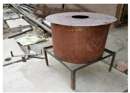
Fig -5: Frame

The circular frame of 52 cm diameter and 42 cm length is prepared by rolling a sheet of metal and welding its ends. The bottom is welded with circular shape metal sheet of 3 mm thickness. The frame houses the furnace and the chamber and also provides thermal insulation.