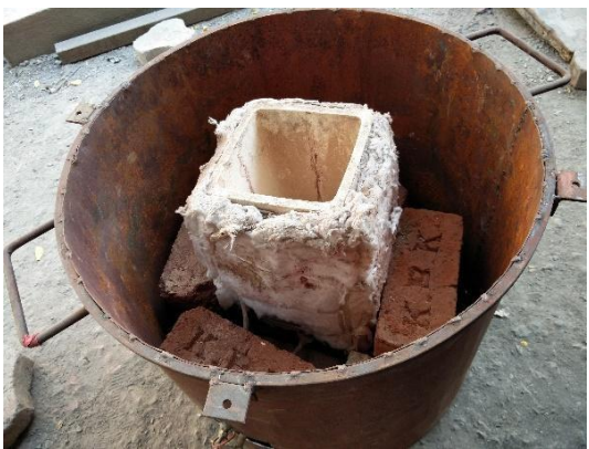
Fig -2: Furnace

The material used for the fabrication of major components is mild steel. Mild steel has a carbon content ranging from 0.15% to 0.30%. It has properties suitable for fabrication and is available easily.