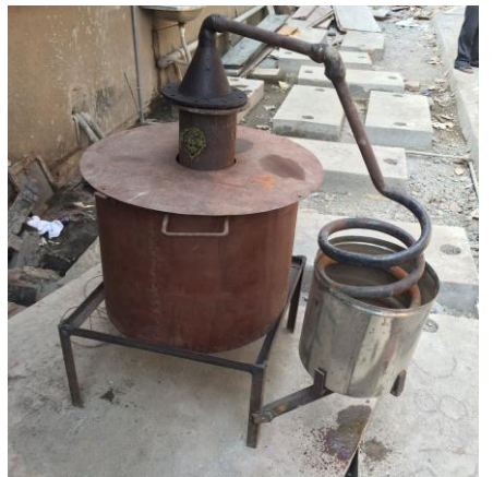
Fig -6: Final setup

lid is then used to cover the furnace inside the frame. The lid prevents heat loss. The penultimate step is inserting the heating chamber through the lid into the furnace. The final step of the assembly is placing the helical coil heat exchanger assembly on the stand.