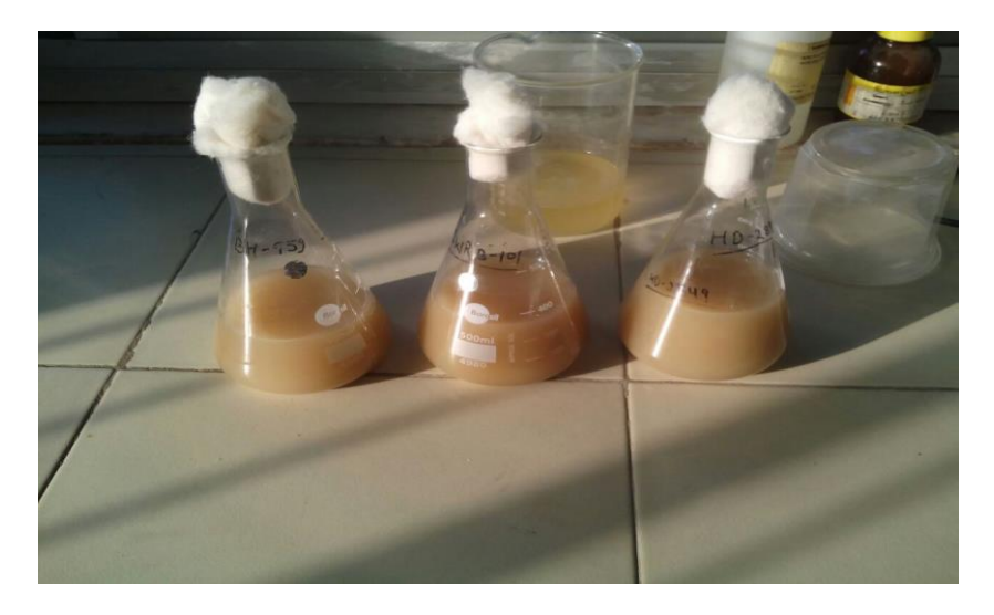
Figure 2.2: prepared wort of selected variety

Boiling of the wort is the process in which enzymes are inactivate and remains protein is coagulated. And during wort boiling hops are added for bitterness and desired flavour & aroma.